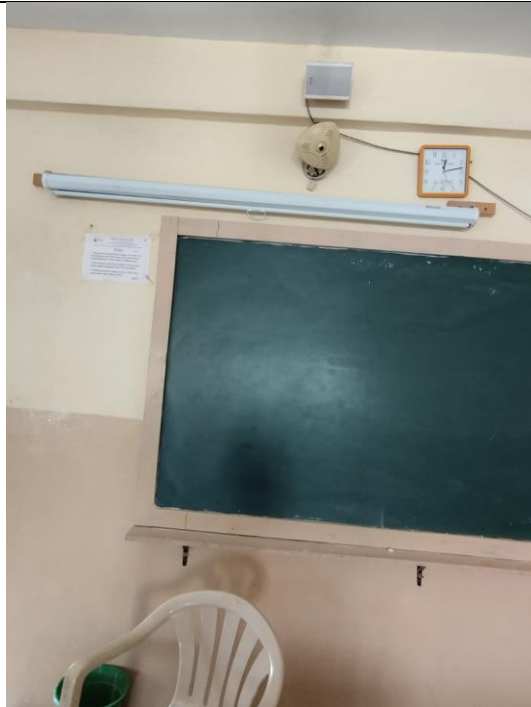
CCTV Camera in Class Room

There are 40 CCTV installed in Institute for security reasons of which all the connections have been connected to a TV which is placed in Principal Cabin which is normally monitored by Principal. 40 CCTV have been installed in all over Classes Corridors, Parking and all around the campus.