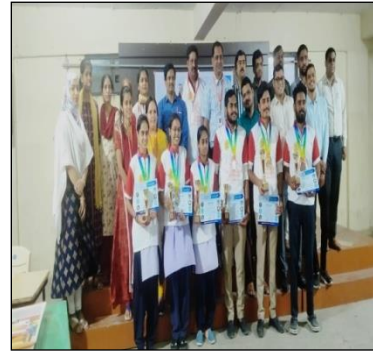
Chess Competition Winners