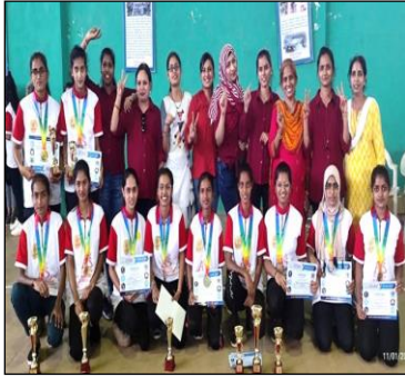
Lay staff with winners of Long jump, Relay race, Running, Badminton.