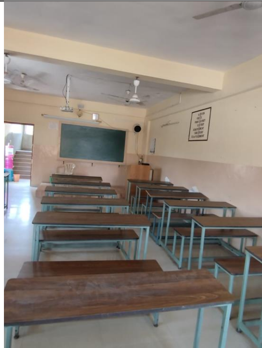
CCTV Camera in Class Room